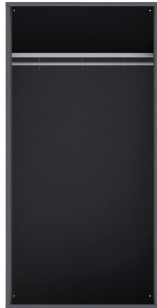
FRONT VIEW W/O DOORS