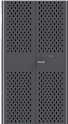
FRONT VIEW W/ DOORS

In the TA50 Series lockers, all of the components are welded into a single rigid unit to resist damage for the life of the product. Equipped with diamond perforated doors and sides, this locker offers a high degree of air flow. It comes with a standard 2 mil thick powder coat baked enamel finish, available in 20 standard colors as well as any custom color.