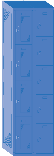
4 & 5 TIER