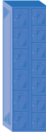
6 & 8 TIER